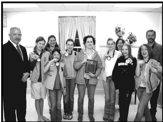
Local Girl Scout Troop # 5860 was honored at May's Borough Council meeting for their service to our community. They were presented a plaque for their work designing and painting the Triangle Park benches and tables.

New Fire Equipment! – Congratulations to the Rutledge Fire Company having recently received a grant for $45,000 to purchase updated fire equipment. Annual fire company donations are down this year, some $3500 to $8000 more is needed to balance their overhead budget. Please consider a small donation. If we all give something, it adds up!