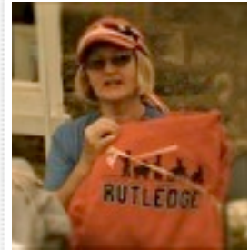
Did you get your T-Shirt?

Many thanks to the 4th of July Committee for making this year's festivities happen!