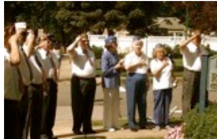
Veterans Saluting the Flag