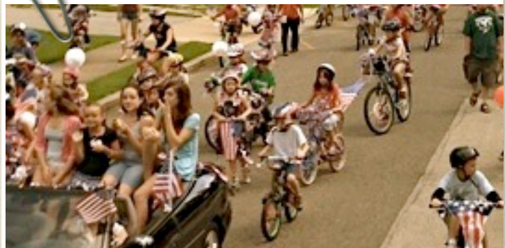
4th of July Parade, 2009