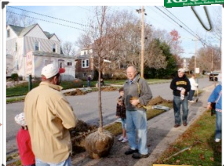
Eleven prunius okame flowering cherry trees were planted on Sylvan Avenue. The Rutledge Tree Commission will meet on January 13 th , 7:30 pm, at the Borough Hall. All are welcome.