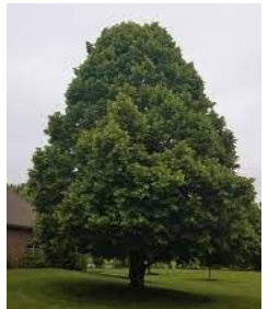
AMERICAN LINDEN 'REDMOND'