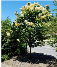
JAPANESE TREE LILAC