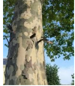
LONDON PLANE 'EXCLAMATION'