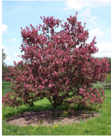
CRABAPPLE 'PURPLE PRINCE'