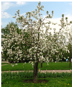
APPLE 'FREEDOM' - SMALL TREE* Crisp, juicy, slightly tart fruit