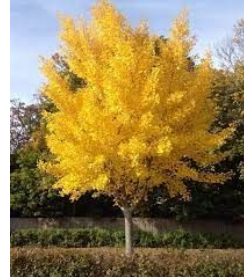
GINKGO 'AUTUMN GOLD'*