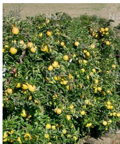
APPLE 'GOLDRUSH' - SMALL TREE* Sweet-tart golden fruit