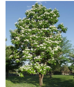
NORTHERN CATALPA 'STRAIGHT UP'