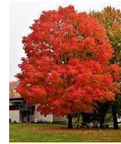
SUGAR MAPLE 'GREEN MOUNTAIN'