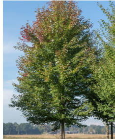
FREEMAN MAPLE 'ARMSTRONG'*