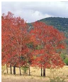
PERSIMMON - LARGE TREE* Slow-growing tree that will get taller in moist areas. Sweet orange fruit.