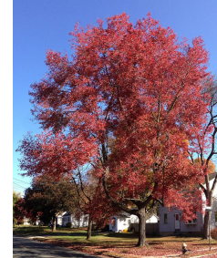
RED MAPLE 'RED SUNSET'