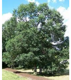
SWAMP WHITE OAK*